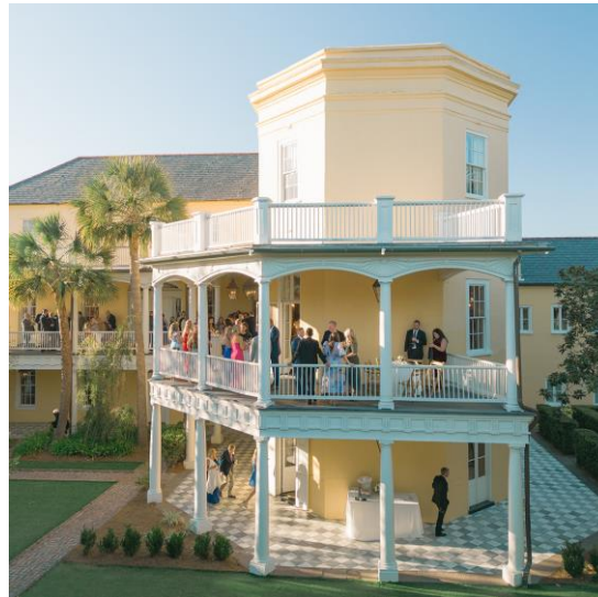
The William Aiken House The American Theater Parcel 32 Lowndes Grove The River House of Lowndes Grove